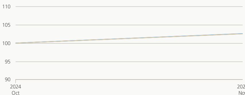
Performance (gross of fees, indexed)

■ Zurich investment foundation ■ Benchmark